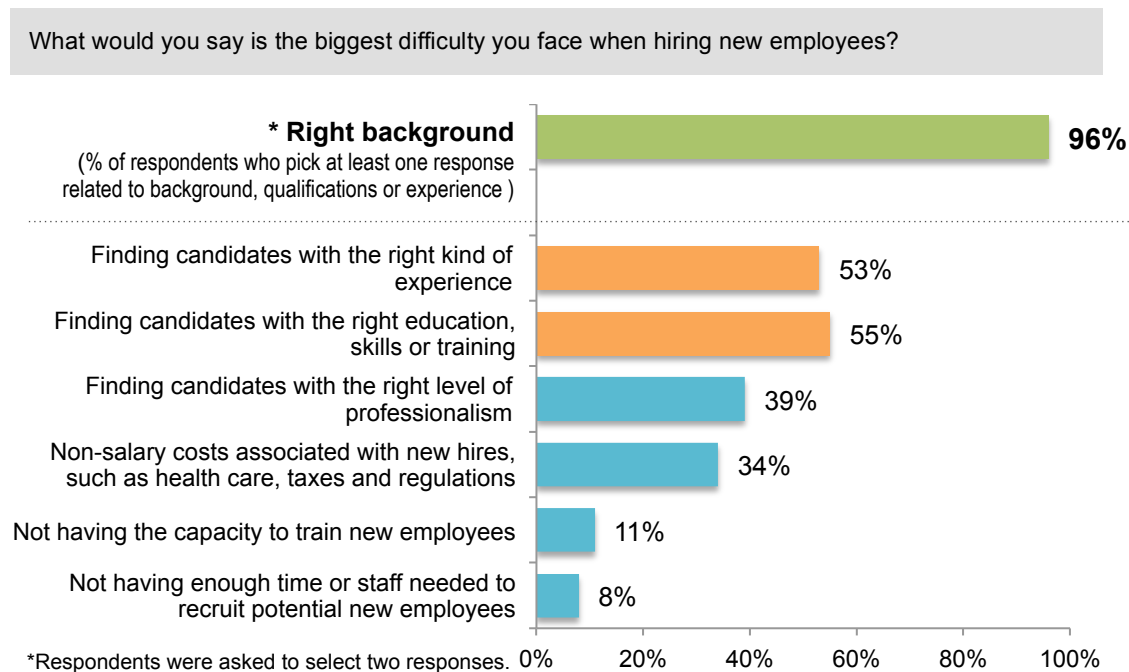
Figure 1: Entrepreneurs identify largest barriers to hiring new employees