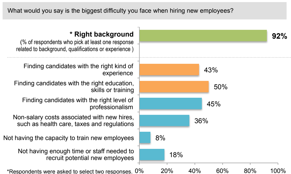
Figure 1: Entrepreneurs identify largest barriers to hiring new employees