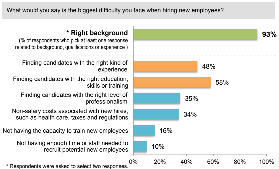
Figure 1: Entrepreneurs identify largest barriers to hiring new employees