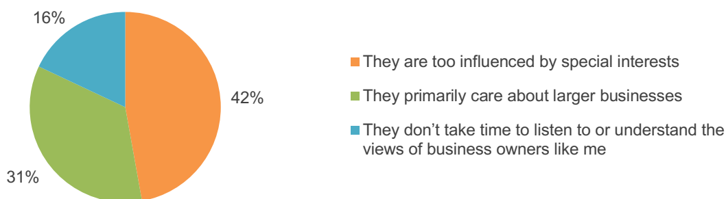
Figure 1: Top reasons Wisconsin small business owners give for why they feel government officials don't understand them

One example of how government officials may have misunderstood the needs of small businesses is during the debates surrounding the Tax Cuts and Jobs Act of 2017. While the new tax law was billed as a boon for small businesses, only 1 in 3 (33%) report it has had a positive impact on their business.