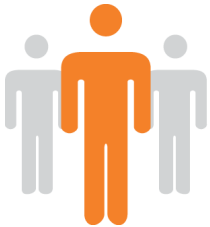
■ Figure 4: Small business owners agree raising the minimum wage would help their business become more competitive

Increasing the minimum wage would be good for small businesses. It means people will have a higher percentage of their income to spend on goods and services and it is proven that low-wage earners tend to spend money at local neighborhood businesses who will be able to grow and hire new workers.